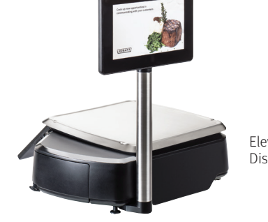
Elevated Customer Display Option